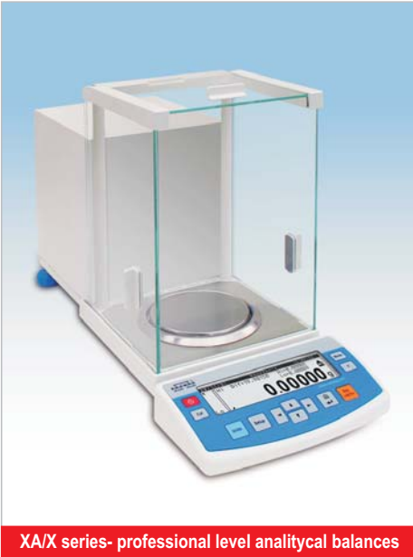
XA/X series- professional level analytical balances

XA/2X balances are equipped with big backlit graphic display with extended menu, 12-keys membrane keyboard, big weighing chamber with sliding upper glass door and side glass door.