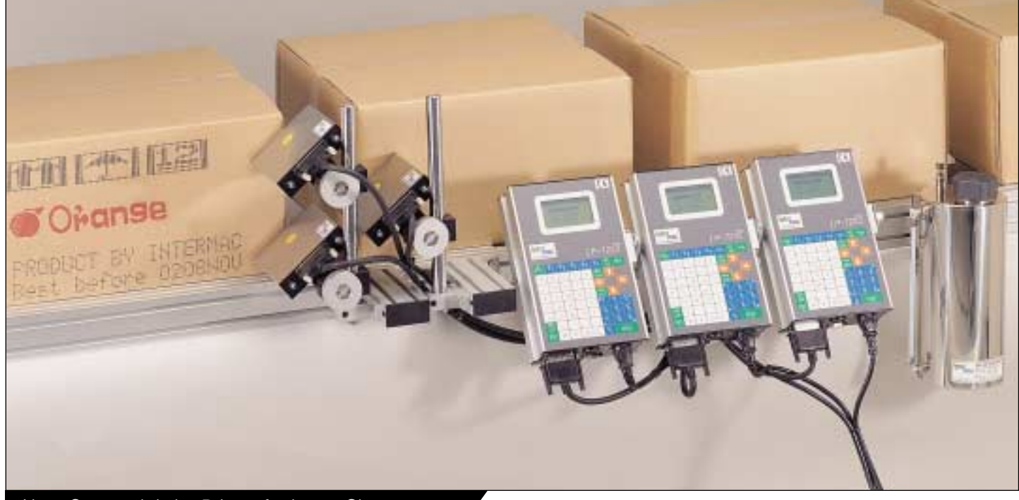
Non-Contact Ink Jet Printer for Large Character