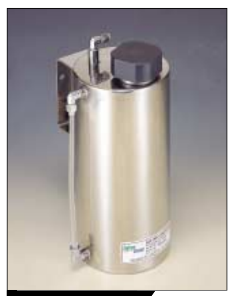
SUS ink container

It also could be mounted top and bottom side depends on your preference.