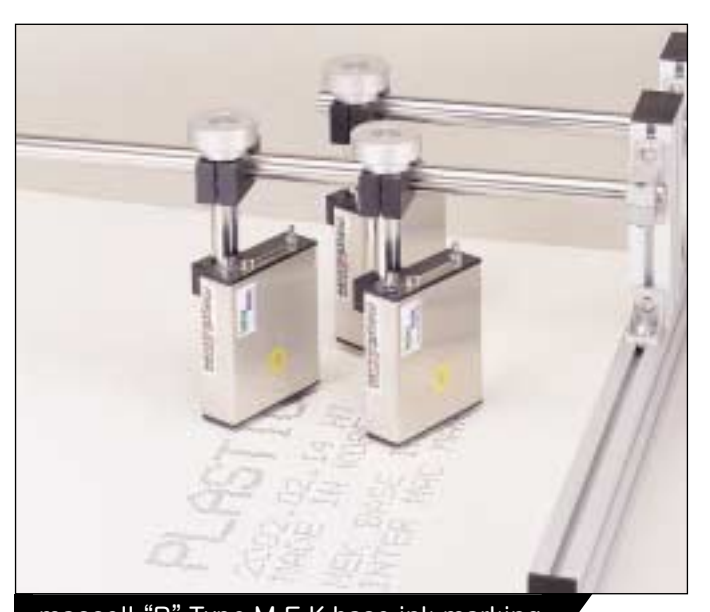
• Fine & Clear dots