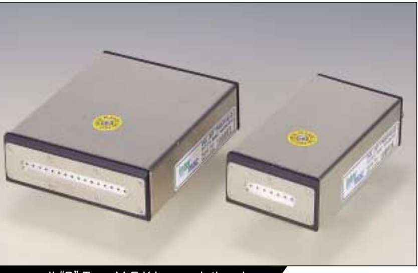
maccell "P" Type M.E.K base printheads