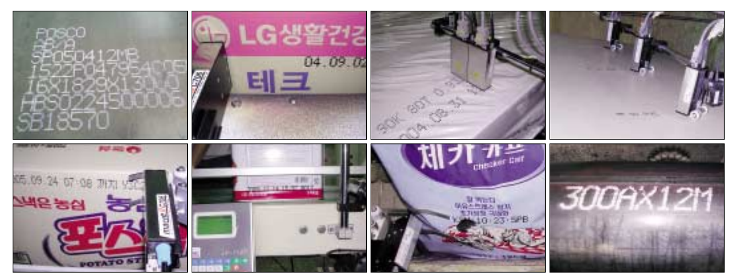
maccell "P" Type M.E.K base ink marking

made by Inter Mac's technology, maccell printhead, We guarantee fine dot marking, no blocked nozzle, wide applications and new marking quality you have never experienced before.