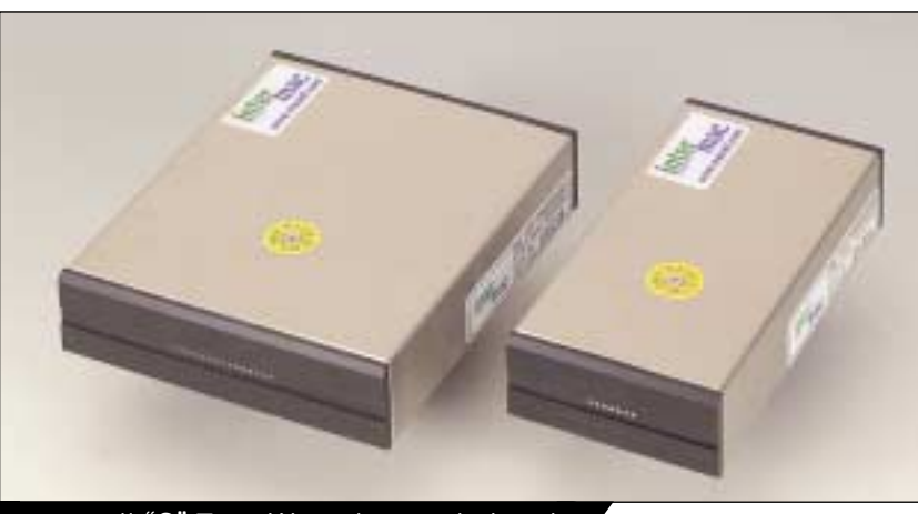
maccell "C" Type Water base printheads

It enables ink recycle and makes auto-cleaning inside of the printhead easier. Because of development of the most compact solenoid valve, marking speed could be more faster and it provides various range of installations.