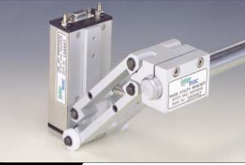
Wave utility bracket