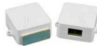
HTemp-1Wire Box2 600 344