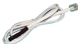
Temp-1Wire 1m 600 242