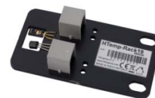
HTemp-Rack19 600 330