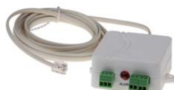
HWg-WLD Relay 600 493