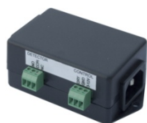
PowerEgg 600 237