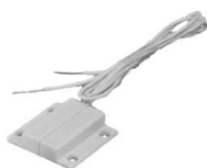
Door Contact 600 119