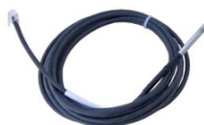
Temp-1Wire-Outdoor 3m 600 311