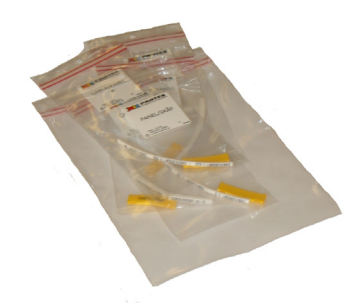
Double-sorted by cable and cabinet