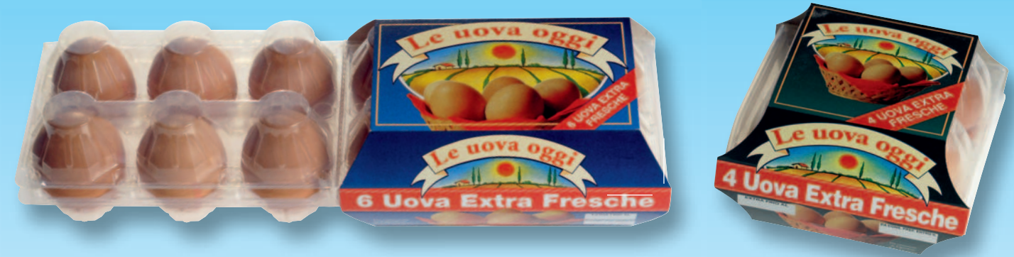
Mod. NEUTRAL + CASE code: PU2X6PN material: POLISTYRENE category of waight: S • M • L