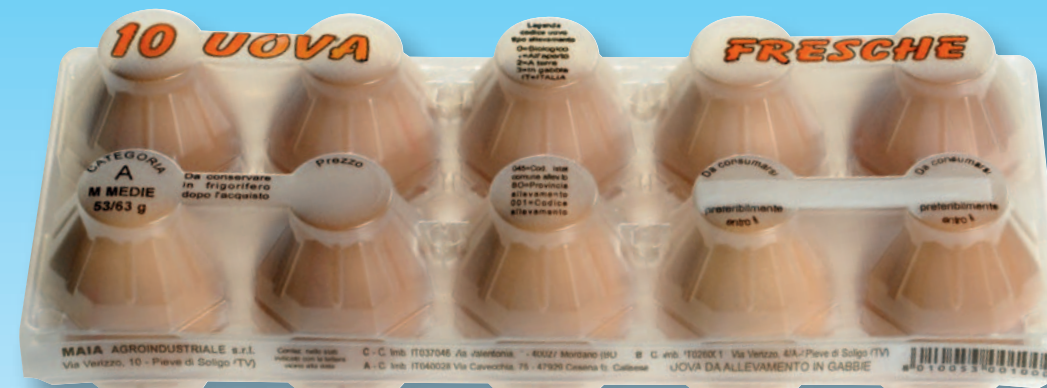
Mod. 10 EGGS code: PUX10 material: POLYSTYRENE category of waight: S • M • L