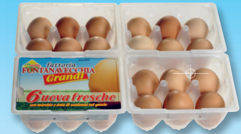
Mod. MAXIPAC code: PU4X6MPOLNOO material: POLISTYRENE category of waight: L