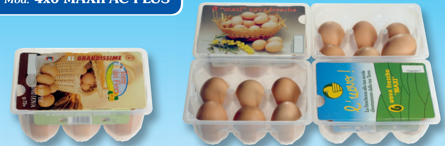
Mod. 4x6 MAXIPAC PLUS code: PU4X6MPN00 material: POLISTYRENE category of waight: XL