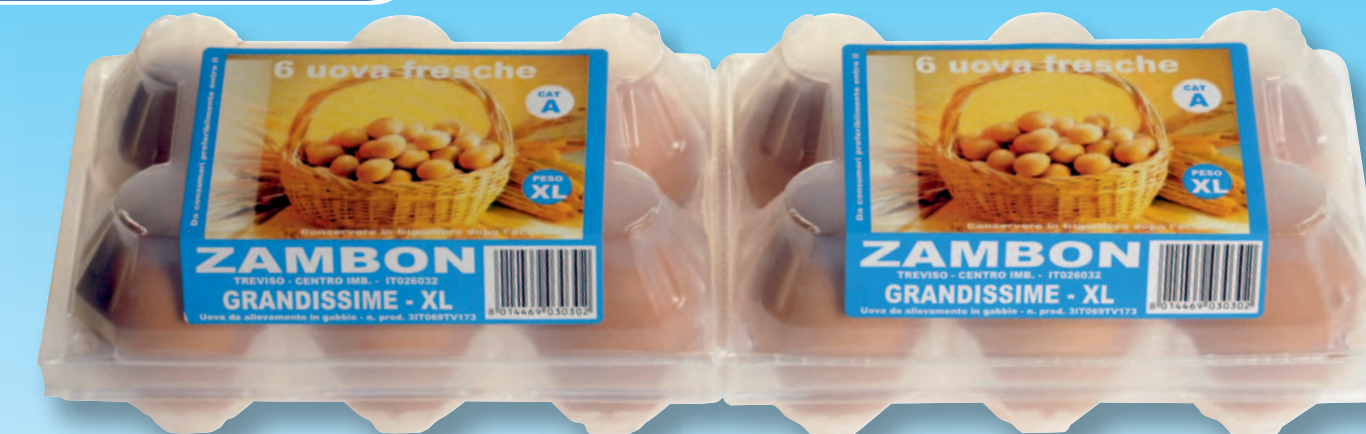
Mod. 2x6 JUMBO code: PU2X6YC material: POLYSTYRENE category of waight: XL