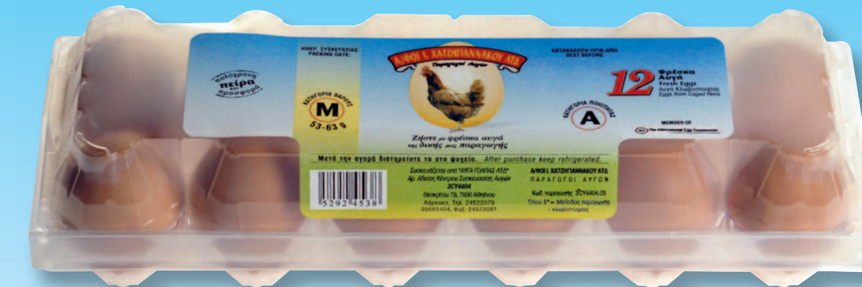
Mod. 1x12 code: PU1X12SS material: POLYSTYRENE category of waight: S • M • L