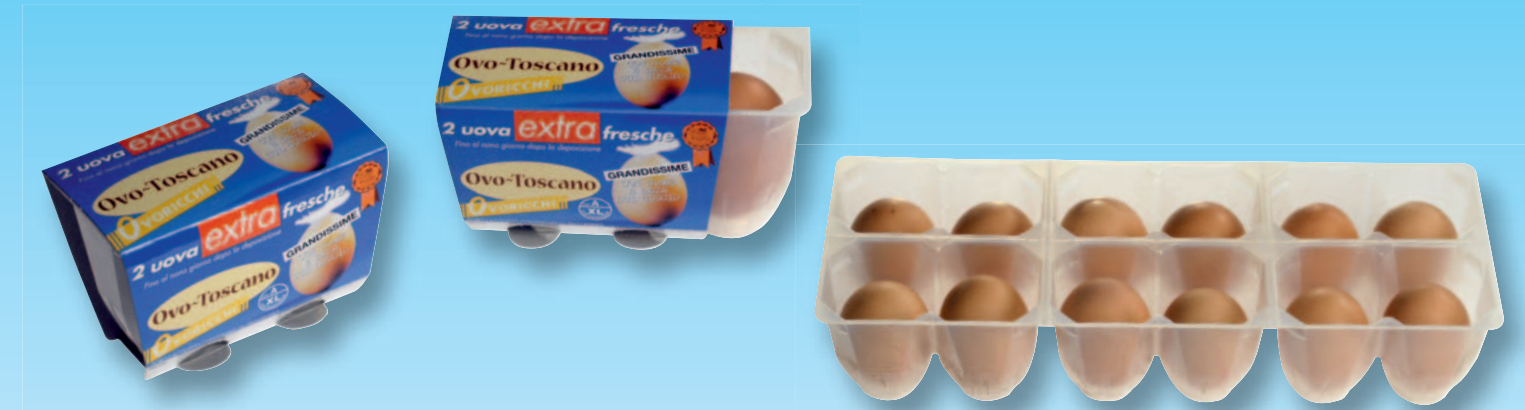
Mod. 2 EGGS code: PU6X200 material: POLISTYRENE category of waight: L • XL