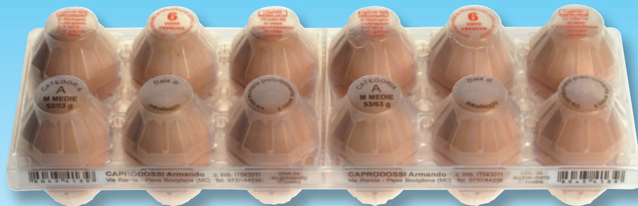
Mod. STANDARD code: PU2X6ST material: POLYSTYRENE category of waight: S • M • L