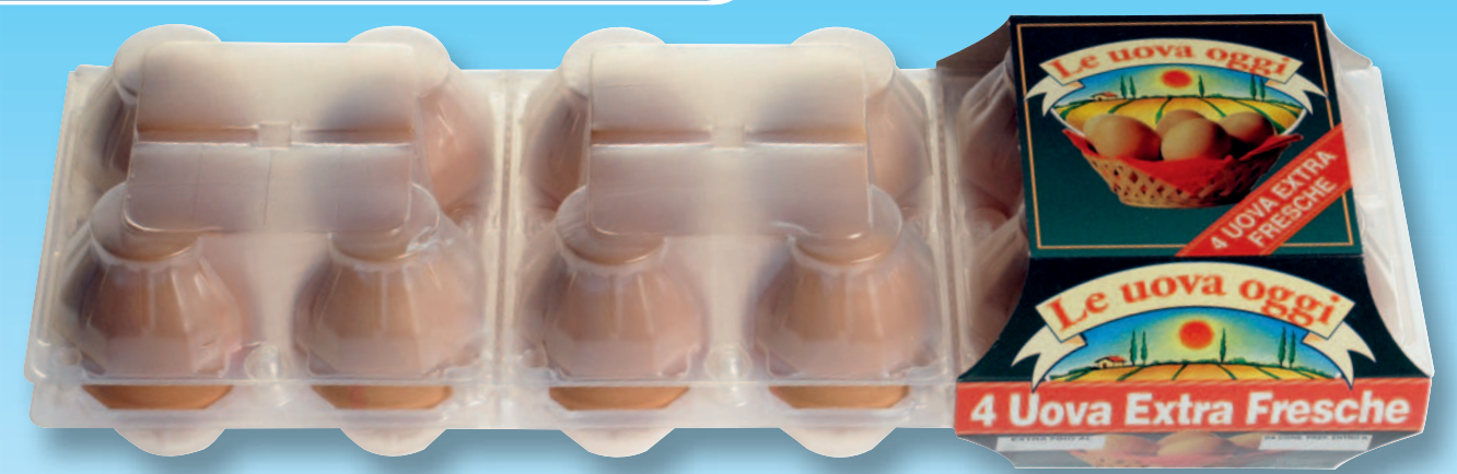
Mod. 3x4 NEUTRAL + CASE code: PU3X4N material: POLISTYRENE category of waight: L • XL