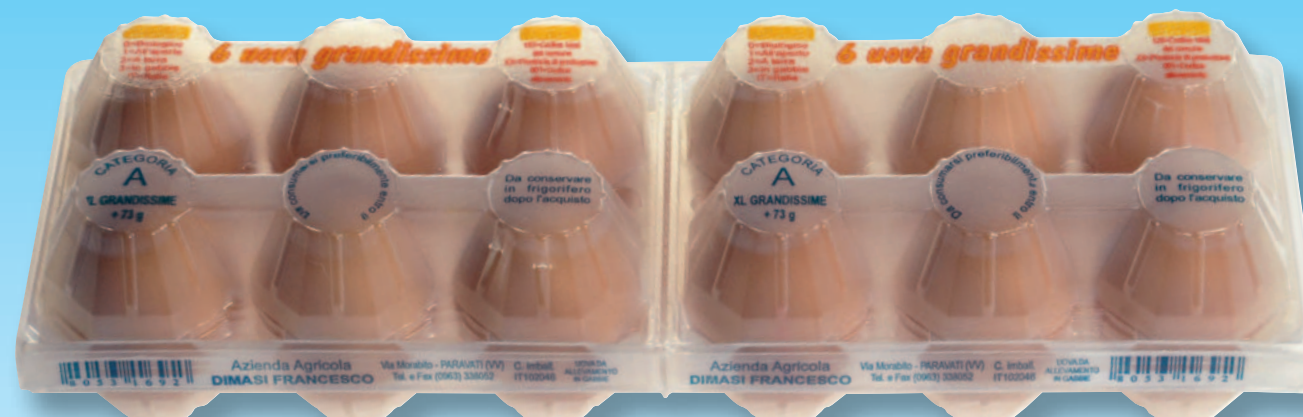
Mod. MAXI code: PU2X6PM material: POLYSTYRENE category of waight: XL