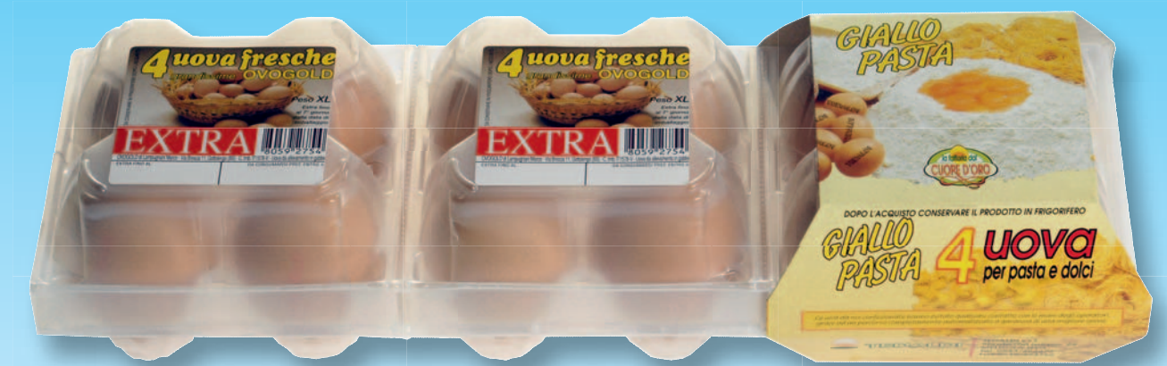
Mod. 3x4 WITH LABEL code: PU3X4N material: POLISTYRENE category of waight: S • M • L