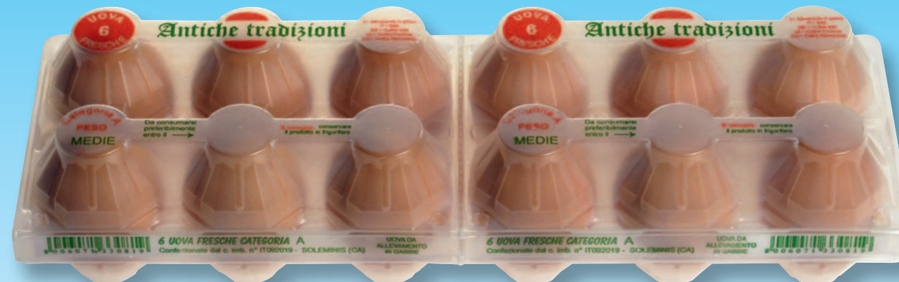
Mod. PERSONALIZZATO code: PU2X6P material: POLYSTYRENE category of waight: S • M • L