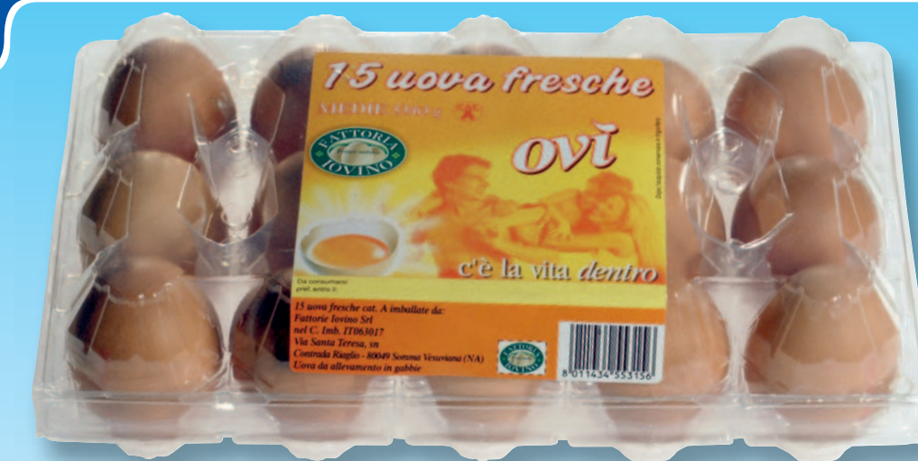
Mod. 15 code: PUX15 material: POLYSTYRENE category of waight: S • M • L