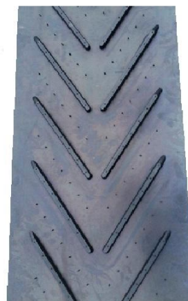
Tabel dimensiuni :