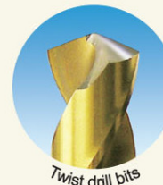
Twist drill bits