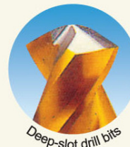
Deep-slot drill bits