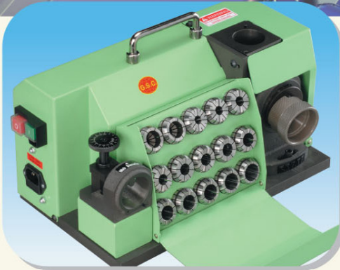
Invisible Tool Box