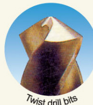
Twist drill bits