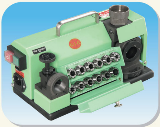
Invisible Tool Box