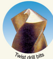
Twist drill bits