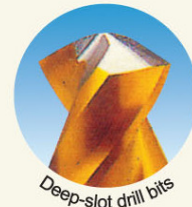
Deep-slot drill bits