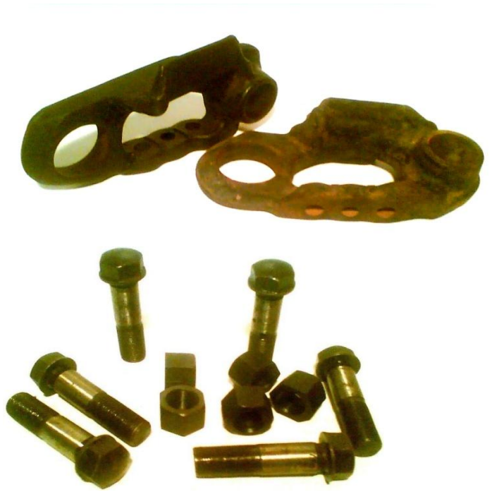
748-22-75 ZA LANT