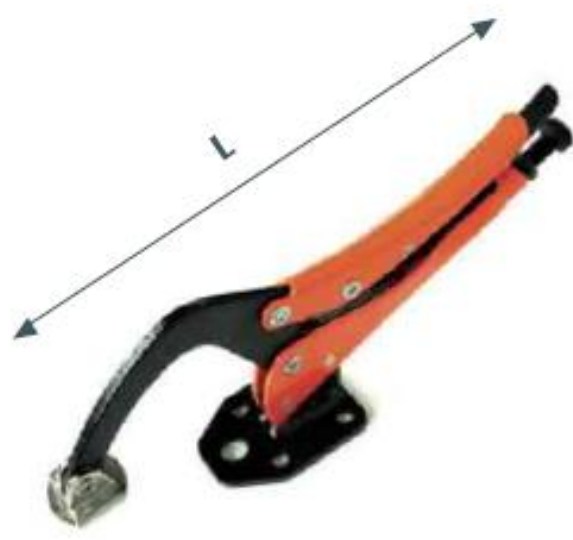
Table C-clamp -Knurled swivel pad. -2 positions fixes and holds objects for drilling welding etc.