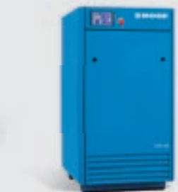
Piston compressor TOP AIR Series