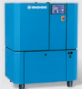
Screw compressor with integral dryer