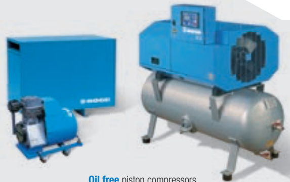
Oil free piston compressors