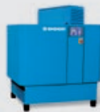
Frequency controlled screw compressors