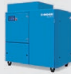
Frequency controlled screw compressor with slide-in dryer