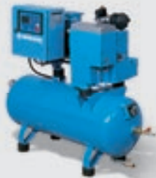
Screw compressor with compact module