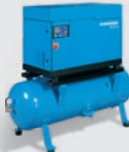
Frequency controlled screw compressor