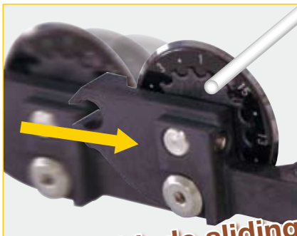
Circular blade sliding

Suitable for FTTH Dedicated for single fiber cleaving. Outstanding cost performance.