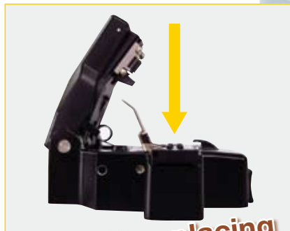
Easy fiber placing