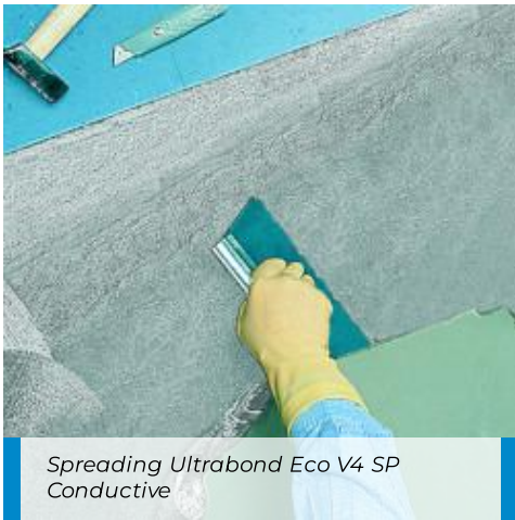
Spreading Ultrabond Eco V4 SP Conductive