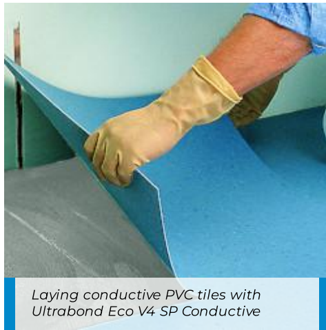
Laying conductive PVC tiles with Ultrabond Eco V4 SP Conductive