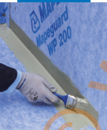
Application of the Mapeguard WP Adhesive in order to seal the joints in the corner before the application of Mapeguard ST