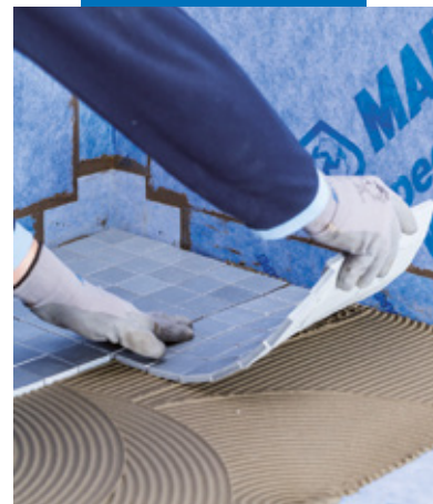
Laying of the tiles