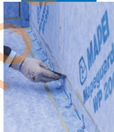
Application of Mapeguard ST

All relevant references for the product are available upon request and from www.mapei.com