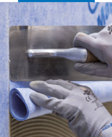
Application of the second sheet