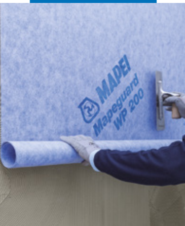
Laying Mapeguard WP 200