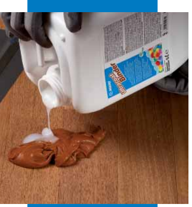
Mixing of Merbau powder with Ultracoat Binder