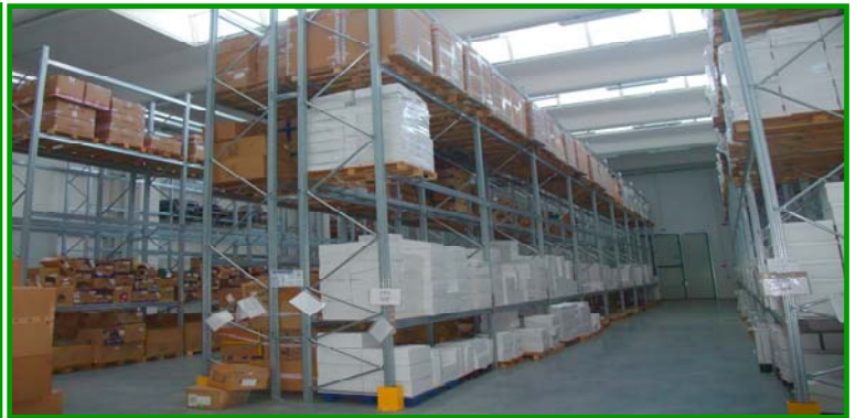
CIVITANOVA MARCHE FACILITY 2 (PORTO SANT'ELPIDIO)