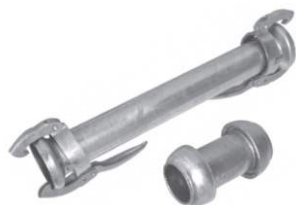
Teava de legatura cu cuple Perrot mama/mama sau tata/tata