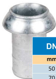
CUPLA PERROT TATA CU STUT PENTRU FURTUN

* Legenda: ST ZN - Otel galvanizat, SS - Inox, SBR - Stiren Butadiena.