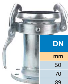
CUPLA PERROT MAMA CU FLANSA DIN 2576 PN 10