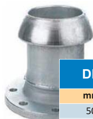
CUPLA PERROT TATA CU FLANSA DIN 2576 PN 10

** Disponibile si cu flansa patrata, cu 4 gauri pentru suruburi de fixare.