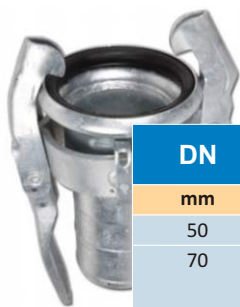
CUPLA PERROT MAMA CU STUT PENTRU FURTUN

PROPRIETATI Se pot cupla in unghi de \pm 15^\circ fata de axa lor de simetrie. Cuple cu debit normal, utilizate in agricultura, la irigatii, la transportul apei, la transportul pneumatic al materialelor abrazive, pe santiere etc.