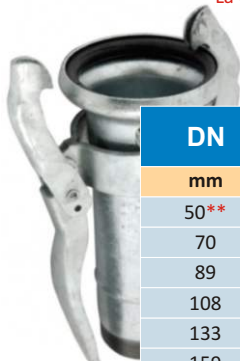
CUPLA PERROT MAMA CU FILET EXTERIOR BSP

** La cerere, prevazuta cu teava scurta.