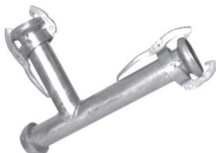
Teu cu cuple Perrot mama/mama/tata, cu aceleasi DN-uri