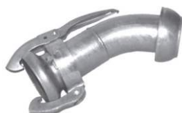
Cot la 30°, 45° sau 90° cu cuple Perrot mama/tata