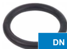
GARNITURA TIP O-RING PENTRU CUPLA MAMA

* Legenda: ST ZN - Otel galvanizat, SBR - Stiren Butadiena.