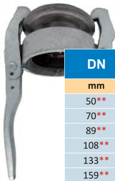
CUPLA PERROT MAMA SUDABILA**