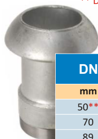
CUPLA PERROT TATA CU FILET EXTERIOR BSP

** Disponibila si cu filet interior BSP.