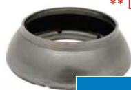
CUPLA PERROT TATA SUDABILA**

** La cerere, prevazuta cu teava scurta.