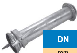
TEAVA CU CUPLE PERROT MAMA/TATA