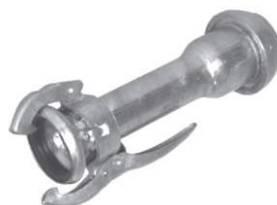
Teava de trecere cu cuple Perrot mama/tata, cu DN-uri diferite