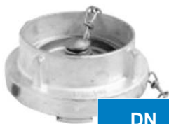
CUPLA STORZ OARBA (CAPAC) CU LANT