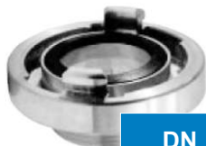
CUPLA STORZ FIXA CU FILET EXTERIOR BSP

PROPRIETATI Flansele sunt fabricate prin forjare, rezultand o rezistenta mecanica a ghearelor de cuplare de 4 ori mai mare decat a cuplelor fabricate prin turnare. Pentru conditii grele de lucru in industrie, transport pneumatic al materialelor abrazive, agricultura, santiere, la stingerea incendiilor sau la transportul apei potabile.