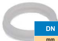
GARNITURA PROFILATA PENTRU APLICATII DE ABSORBȚIE / REFULARE

** Disponibile cu flansa din plastic si miez din aluminiu. Presiunea de lucru 10 bar / 145 psi.