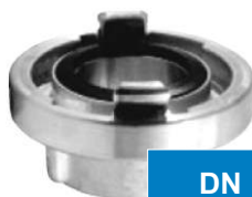
CUPLA STORZ CU FILET INTERIOR BSP