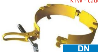
COLIER DE SIGURANTA CUPLE STORZ (PATENTAT IN GERMANIA)

Legenda: NBR - acrilonitril butadiena; Si - silicon; FPM - Viton; EPDM - Etilen Propilen Diena; KTW - cauciuc alb pentru apa potabila.