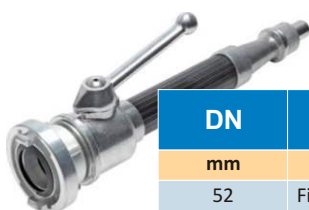
JET SPRAY CONFORM DIN 14365 DIN ALUMINIU *

* Sorbul este disponibil si fara cos. Cosul este disponibil si fara sorb.