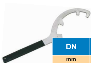
CHEI PENTRU CUPLE STORZ