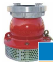
SORB CU SUPAPA DE SENS, CUPLA SI COS *