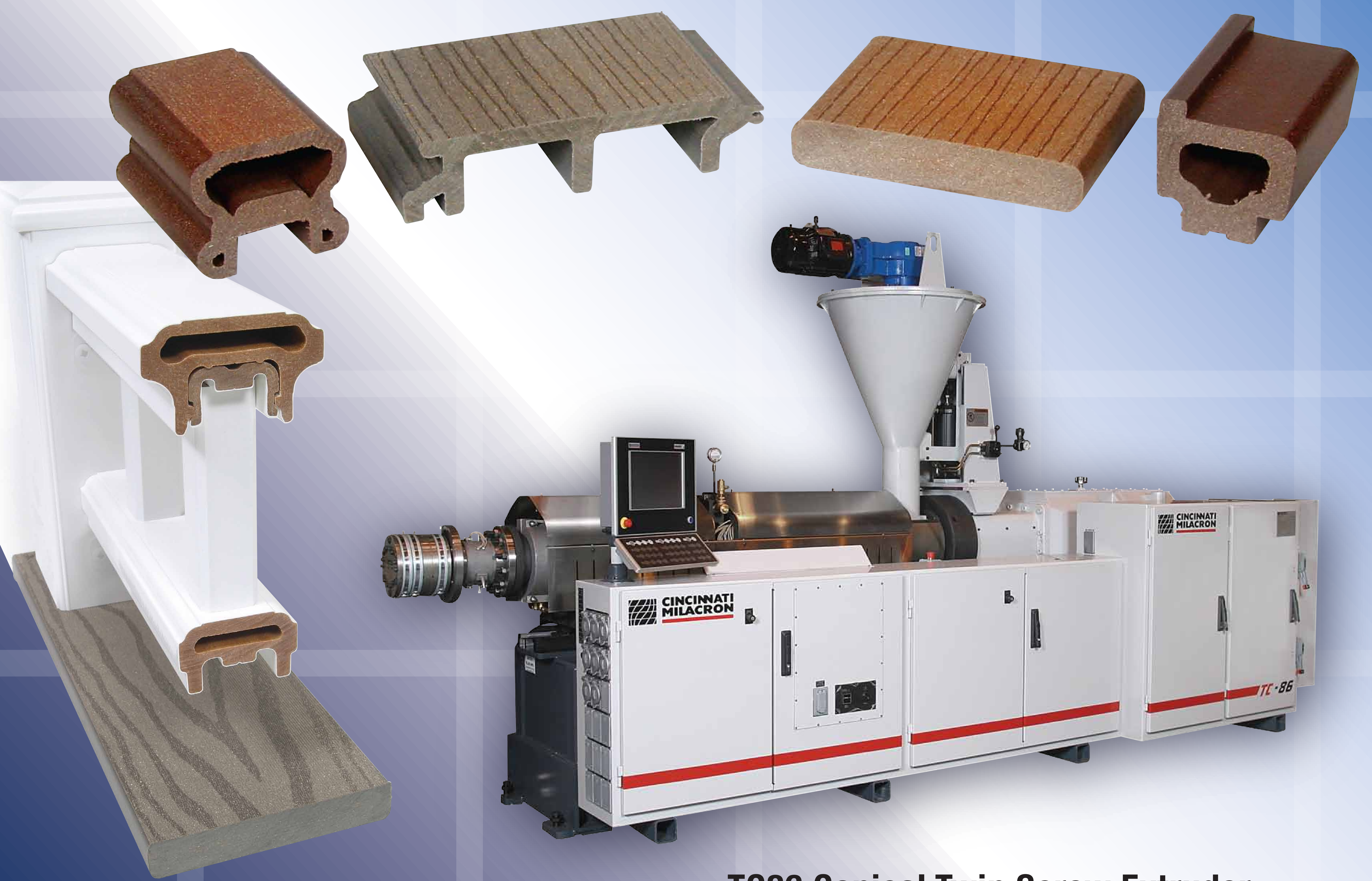
TC86 Conical Twin Screw Extruder

Global Leader in Extruder Technology for Wood & Bio-Fiber Plastic Composites