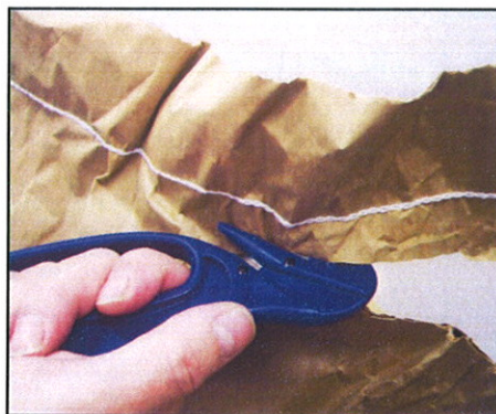
Bags & Sacks