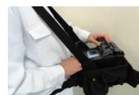
④ -1 Working Belt in Action