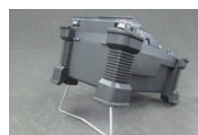
③ Angled Stand in Action