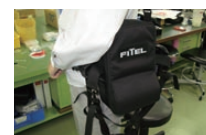
④ -2 Working Belt in Action