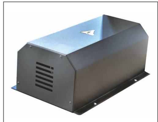
CARTER FOR ROTATION'S MOTOR