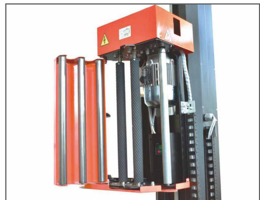
IN OPTION: POWER PRE-STRETCH CARRIAGE

Power Pre-Stretch carriage; 1650 mm turntable; Pit frame; Ramp.