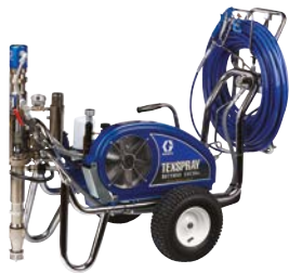
DUTYMAX™ EH230DI PROCONTRACTOR