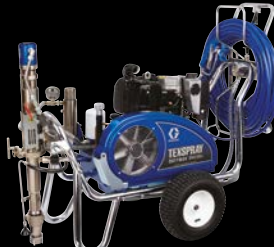
DUTYMAX™ DH230DI PROCONTRACTOR