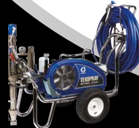
DUTYMAX™ EH300DI PROCONTRACTOR