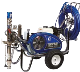
DUTYMAX™ GH230DI PROCONTRACTOR