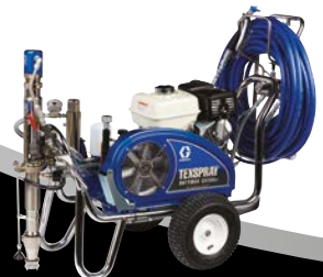
DUTYMAX™ GH300DI PROCONTRACTOR