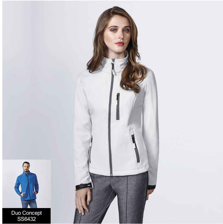
Duo Concept SS6432