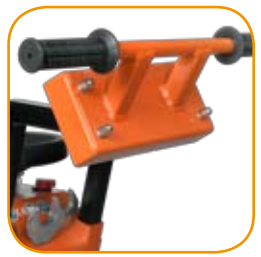
Handlebar equipped with vibration absorbers.