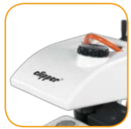
Easy removal of water tank.