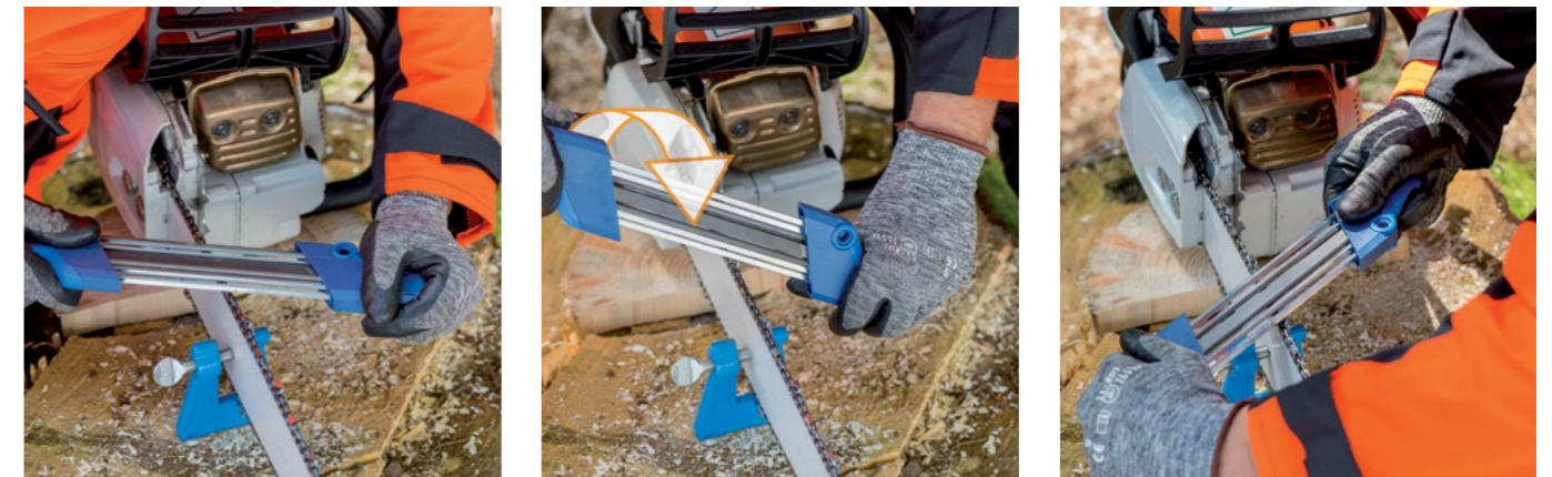
Change from left to right tooth by turning the device.