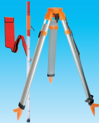
Optional accessory: Outdoor package Ref.-No. 200 350