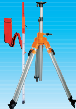
Optional accessory: Indoor package Ref.-No. 210 350